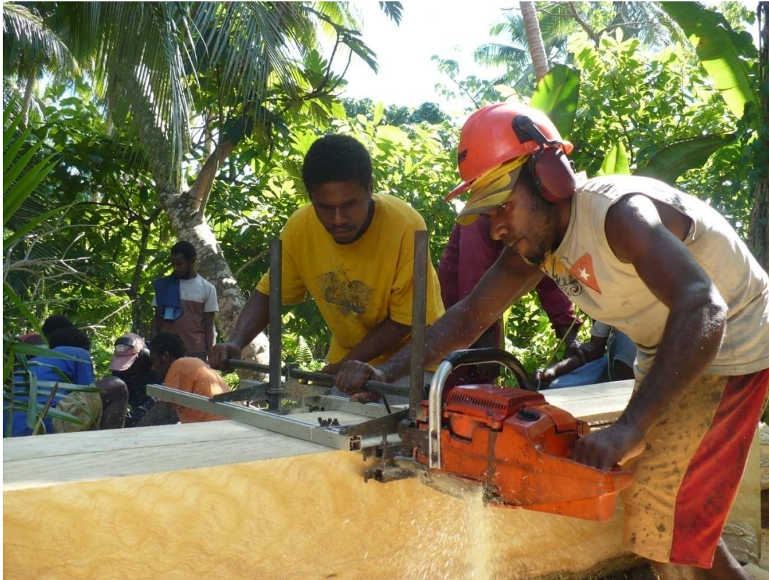
Participants putting into practice skills and knowledge gained in Chalk line Chain Saw Mini-Mill, Unua 2, SE Malekula

While the workshop targeted mainly aspects of chalk line and chain saw Mini-Milling plus Health and Safety & maintenance, it also educated this group of people on the importance of reforestation. Hence, participants were engaged in tree planting after felling of each tree.