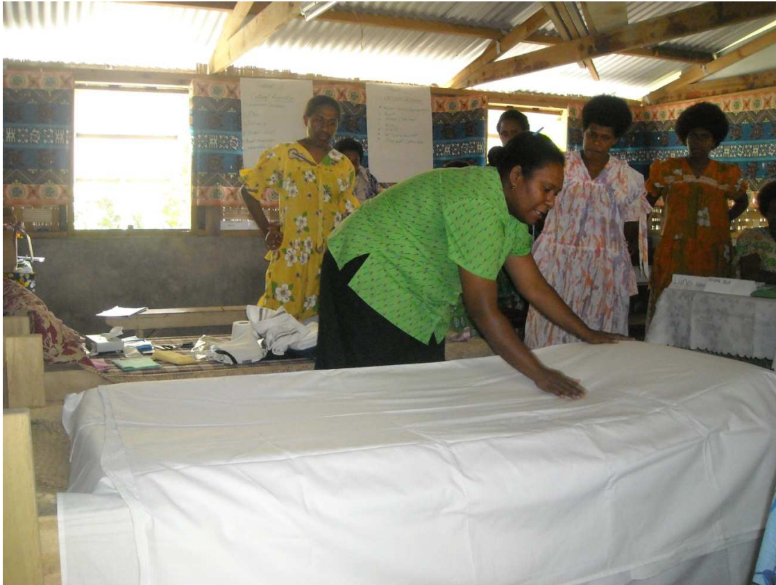
Participants carefully observing, while VIT trainer demonstrates Housing-Keeping techniques in bed preparations