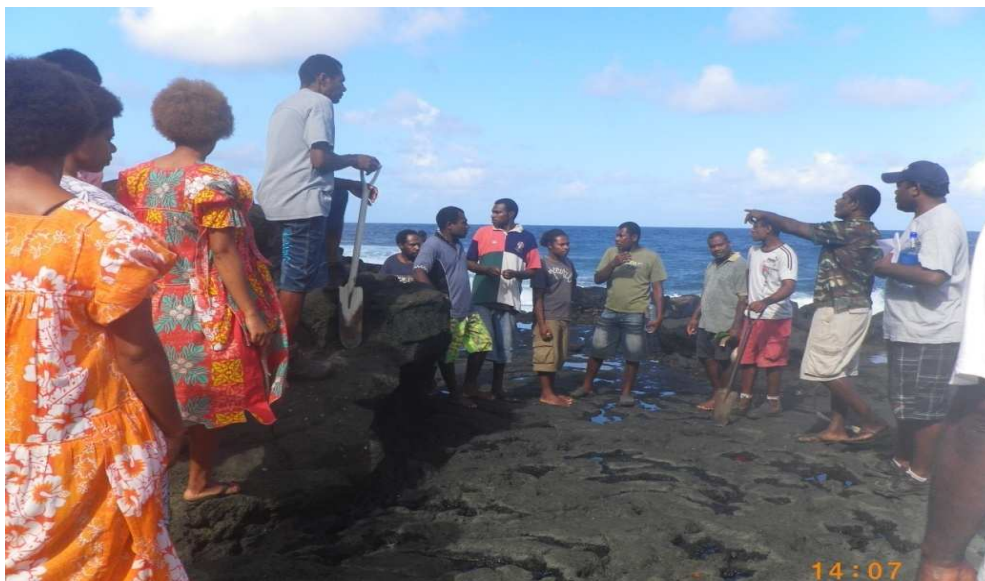
Tour guide participants undertaking tour around the community locating sites preparing for setting up of a new village tour