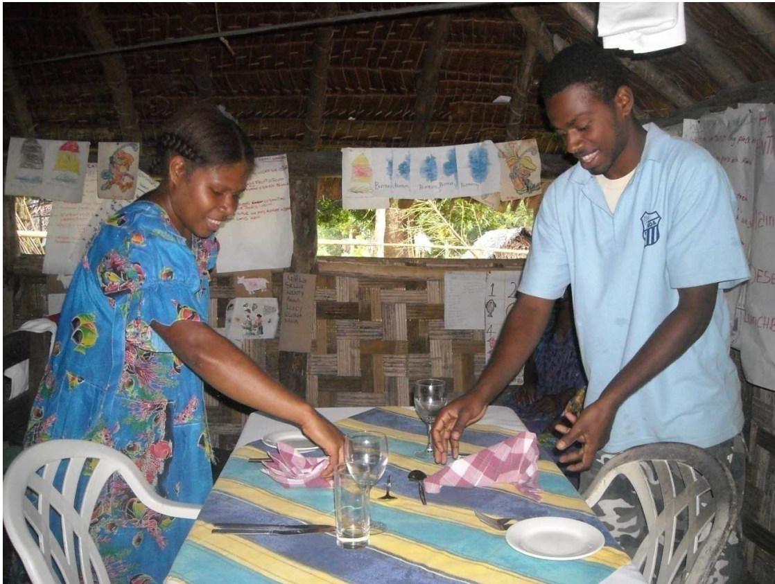
Participants putting into practice skills and knowledge gained from Food & Beverage Training, SE Ambrym

This month the Malampa TVET Centre in collaboration with VIT successfully completed five training activities. These include two (2) House Keeping, two (2) Food & Beverage and one (1) Tour Guide. These were all delivered at Penabo Village, South East Ambrym from 11 to 22 July 2011.